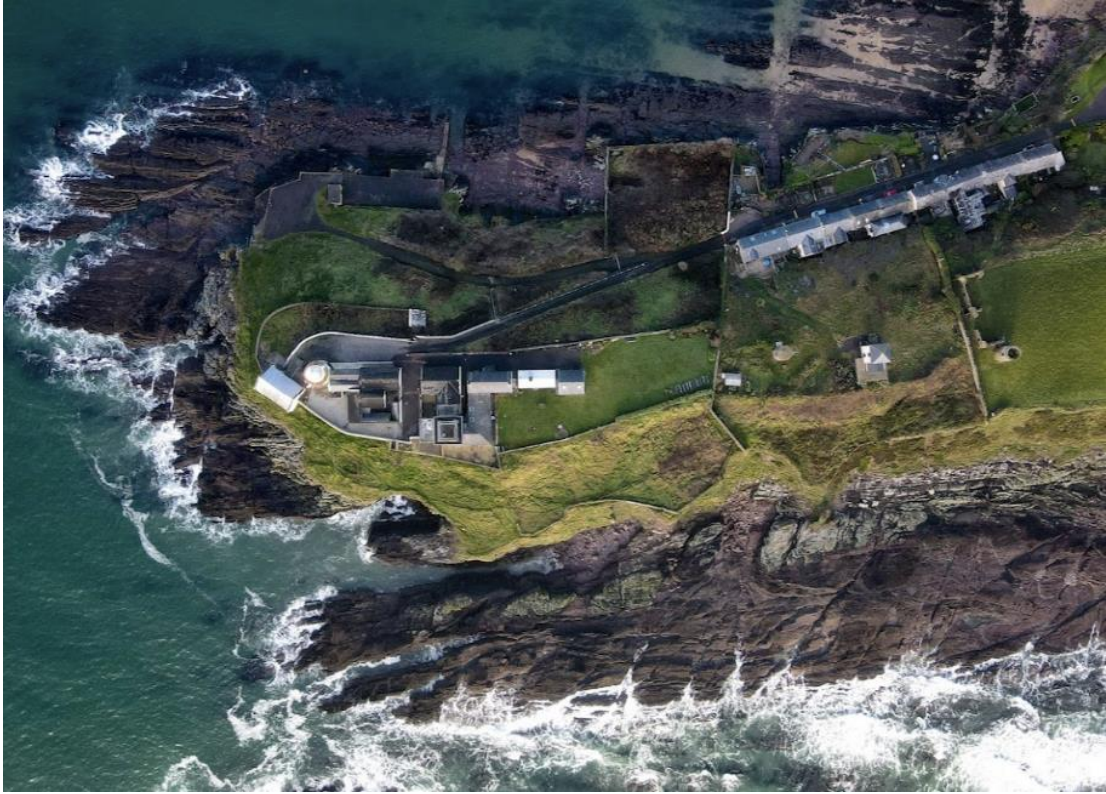
Lighthouse from above and surroundings