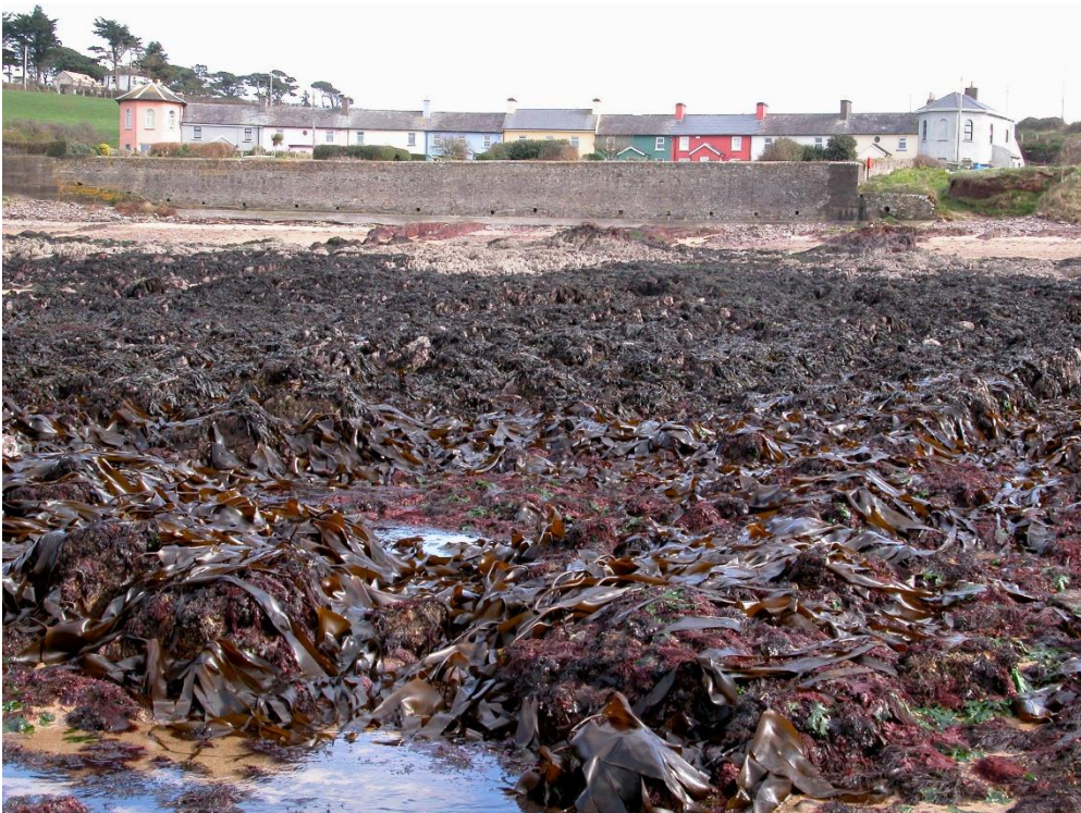
Roches point from the beach to the houses view