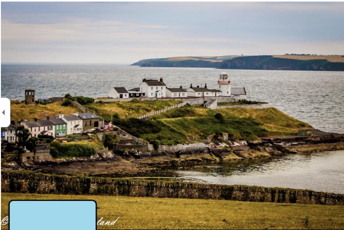
The lighthouse at Roches point