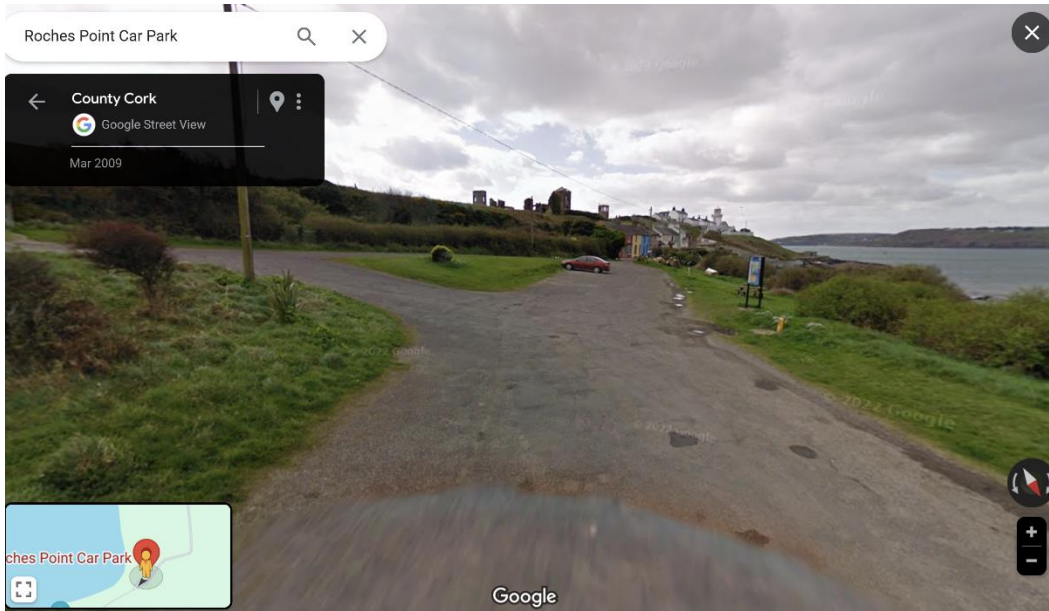
Carpark at roches point